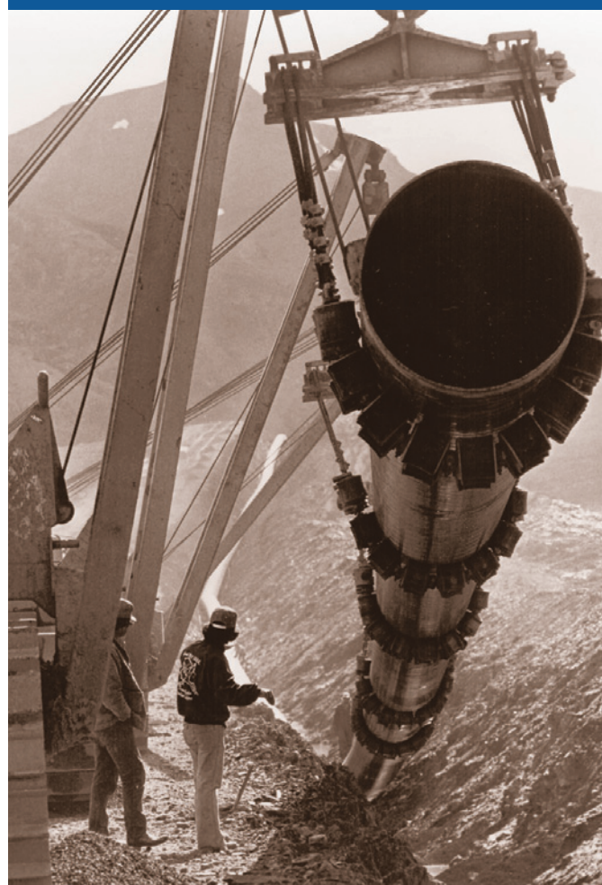
Installation of the last portion of the trans-Alaska oil pipeline, 1976.