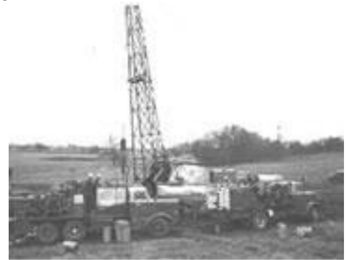
Hydraulic Fracturing Job Circa 1950