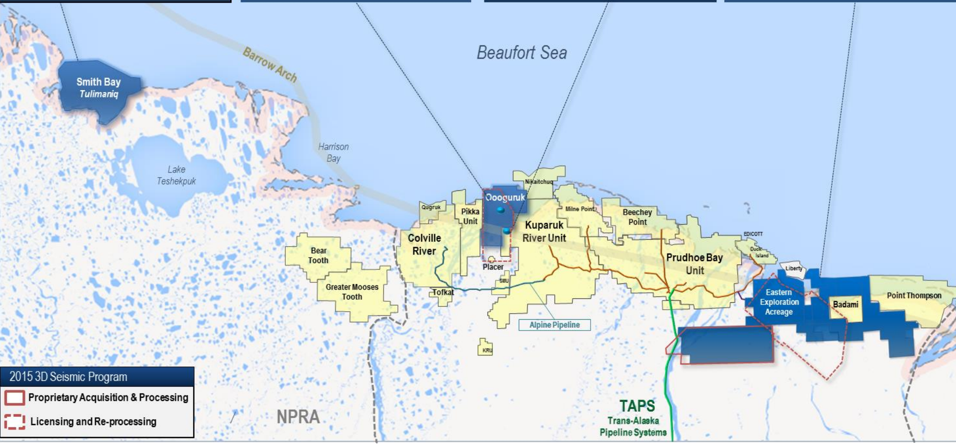
Eastern ANS Exploration Acreage